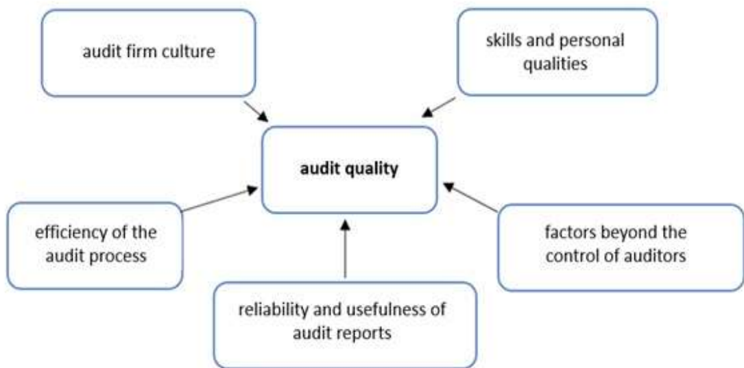
FIGURE 1. Audit quality structure